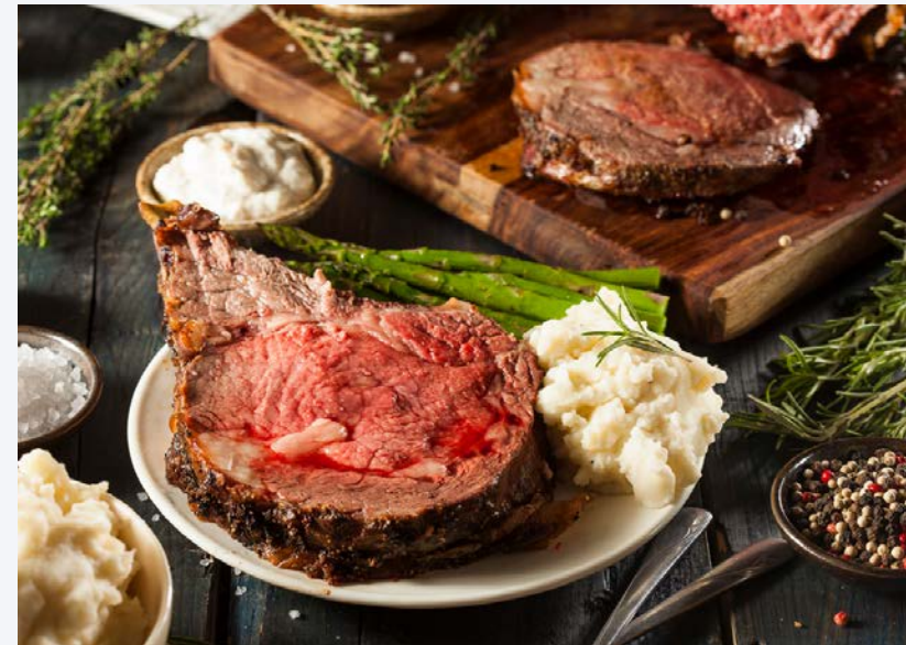
MR. A'S PATIO BUFFET

Includes: Baron of beef with au jus, chicken coq au vin, lasagna, roast potatoes, rice pilaf, green salad, potato salad, garden vegetables and fresh dinner rolls