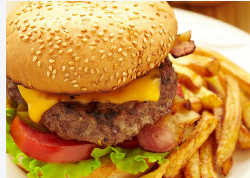
BURGER & BREW

Friday and Saturday night Prime Rib Buffet featuring a wide range of starters, entrees, prime rib and desserts