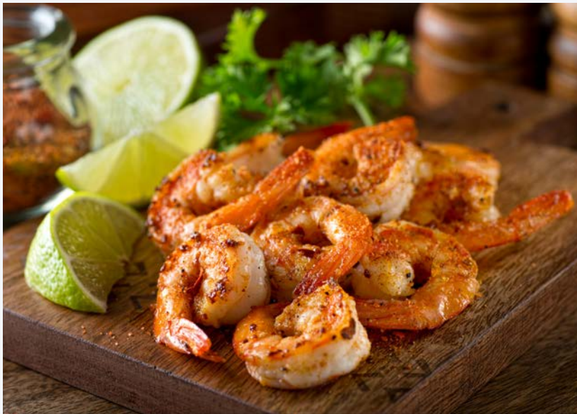
MR. A'S PATIO BUFFET

Includes: Baron of beef with au jus, chicken coq au vin, lasagna, roast potatoes, rice pilaf, green salad, potato salad, garden vegetables and fresh dinner rolls