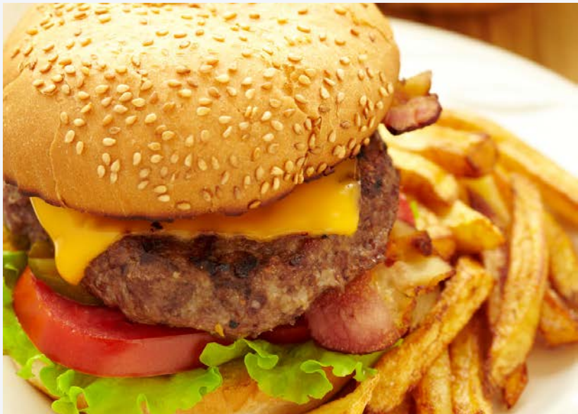
BURGER & BREW

Includes: Thursday and night Seafood Buffet, Friday and Saturday night Prime Rib Buffet and Continental Buffet on Sundays